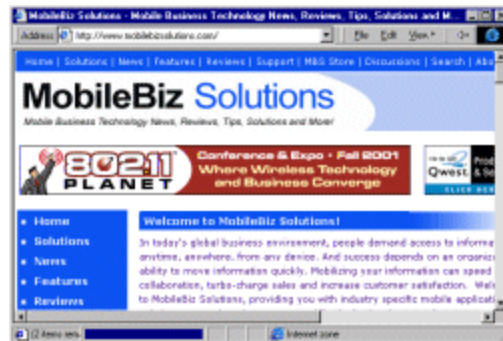
Figure 2 - MobileBizSolutions

In each subsequent newsletter, we will provide information about one of our affiliated partners. We believe that you will find the skills and services offered by our select partners of value to you as well. In this issue, we cover MobileBizSolutions , who was added as a partner in August 2001.