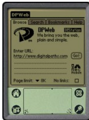
Figure 2 -- DPWeb WAP browser

DPWeb - ( http://www.digitalpaths.com/prodserv/dpwebdx.htm ) is a useful (and free) full WAP browser for the Palm VII, the Kyocera Smartphone, and Palm devices with Palm's Mobile Internet Kit.