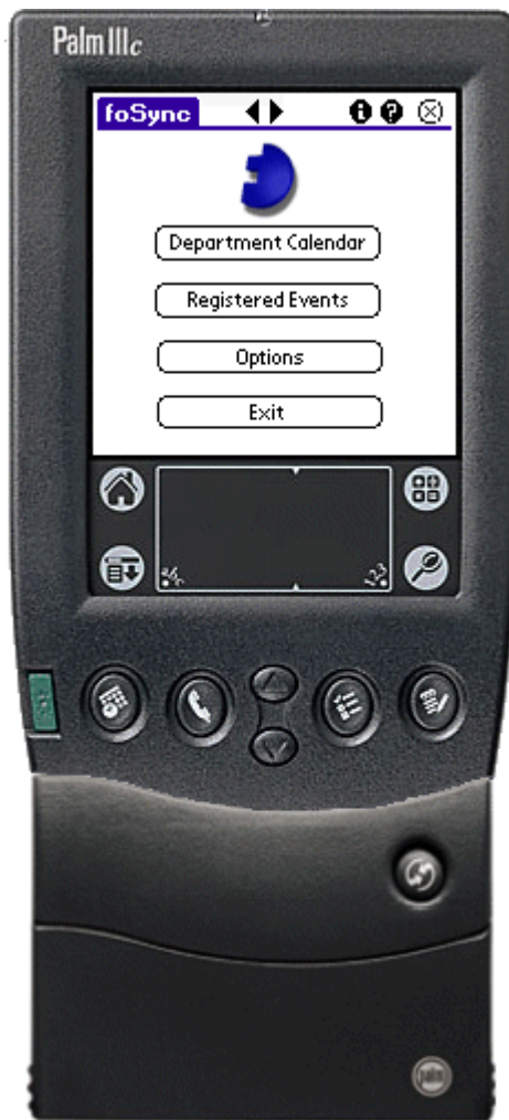
Figure 4 - The palm foSync application focuses on ease of use.