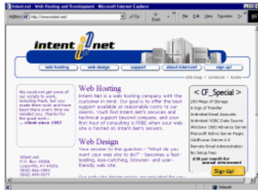
Figure 5 - Intent.Net

The second FO affiliate to be covered is Intent.Net , a large, Southern USA-based Internet Service Provider (ISP). They were added as a FO partner in September 2001.